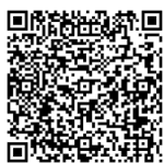
Agrozen Laboratory Authenticity QR Code